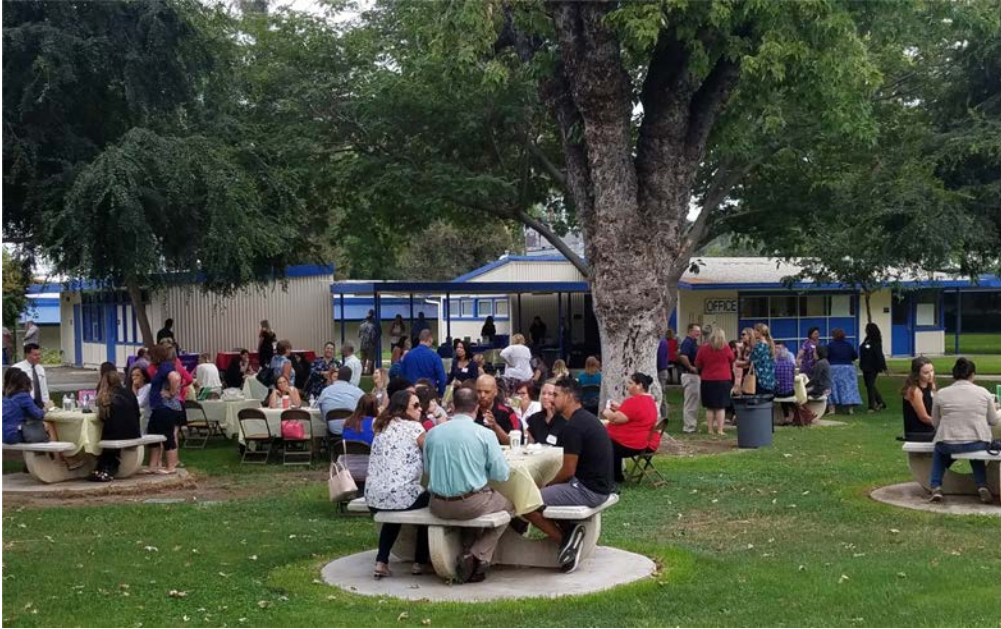
Photo 4: Bonita Unified welcomes new staff at the New Staff Orientation