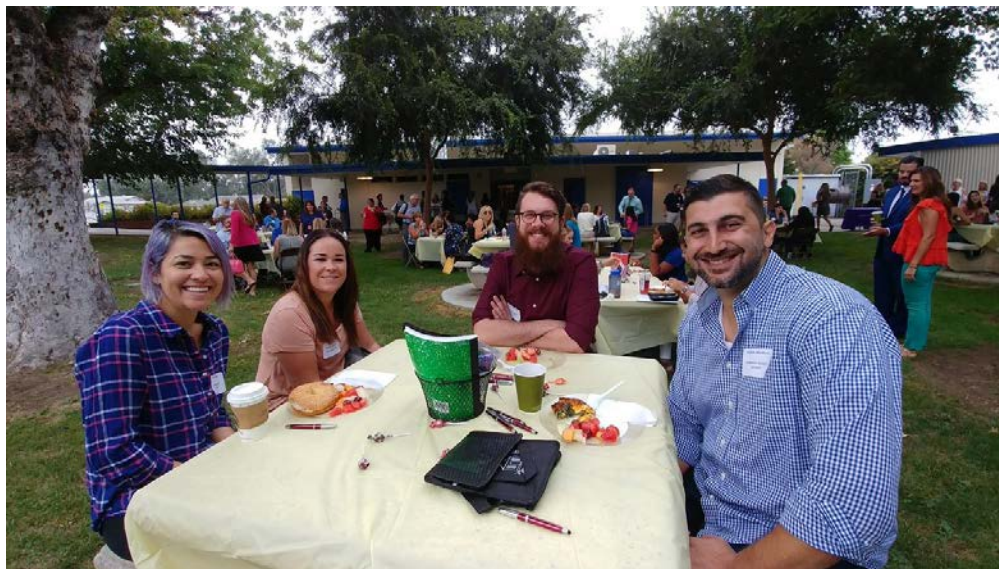
Photo 3: New staff enjoying breakfast at the New Staff Orientation